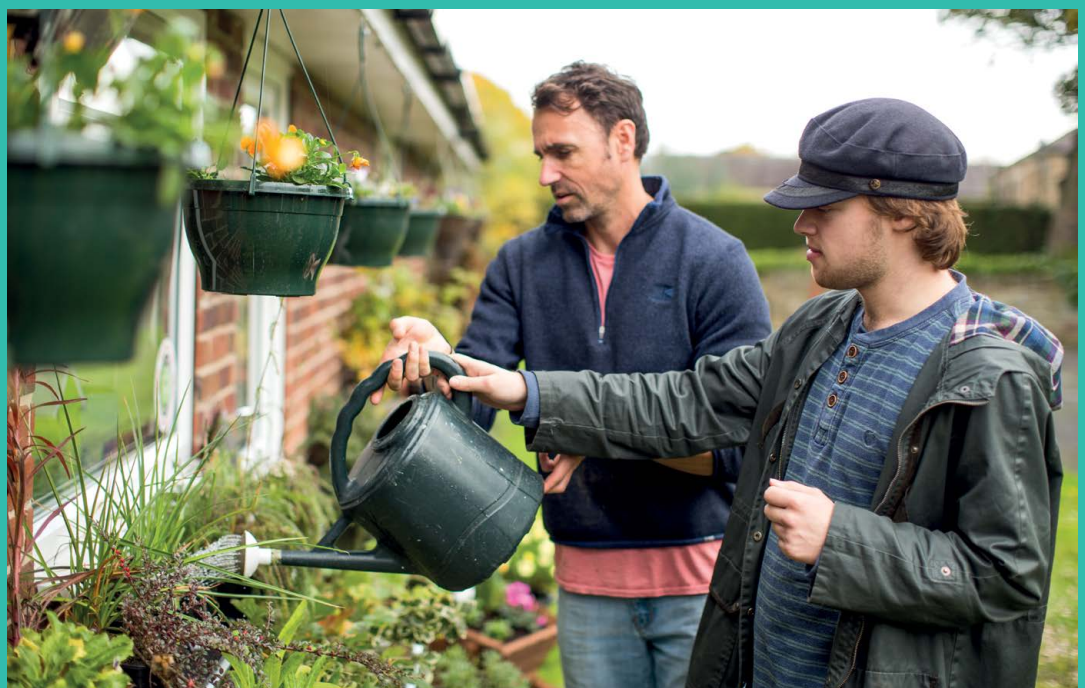
Support worker and person we support

adults, which will enable us to better meet the needs of people we support now and into the future.