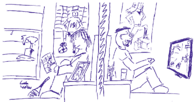
Gordon's illustration of lockdown